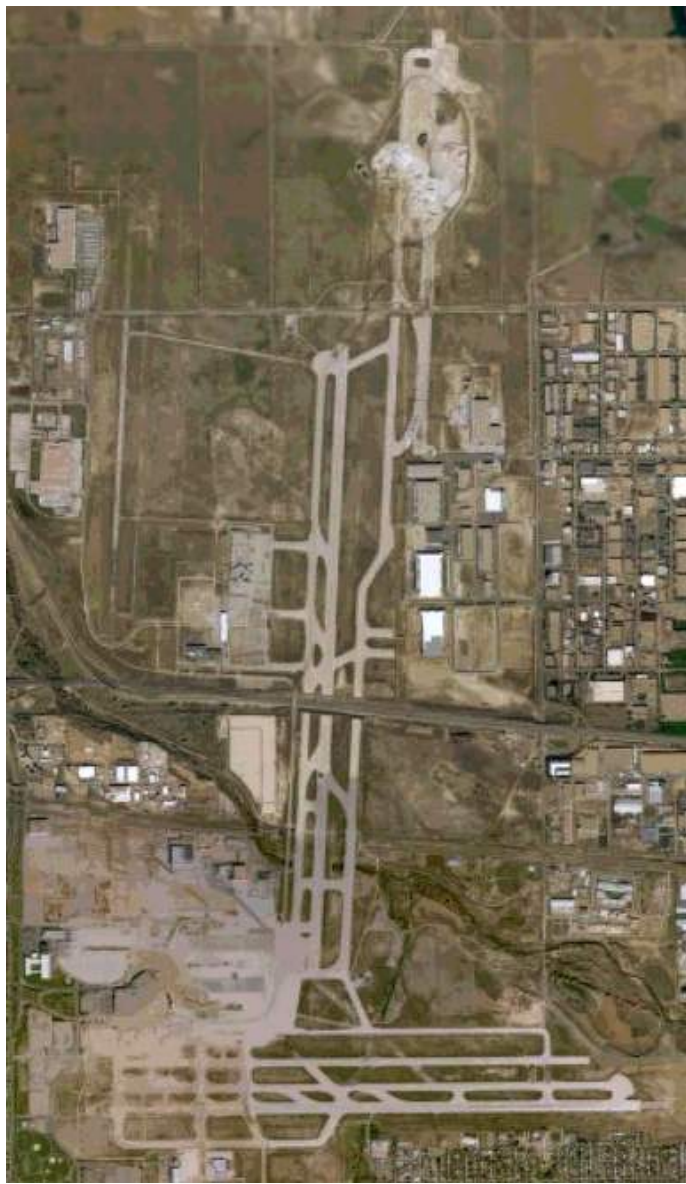
Figure 3: Before and After Photos of Stapleton International Airport

Emma Fried-Cassorla Green Design and the City 9/25/07