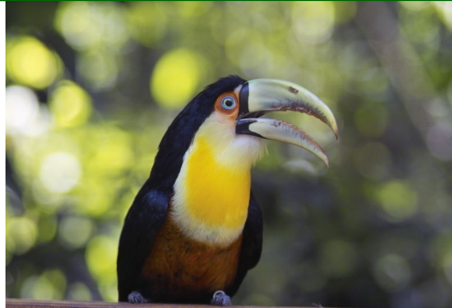
Tucano de Bico Verde