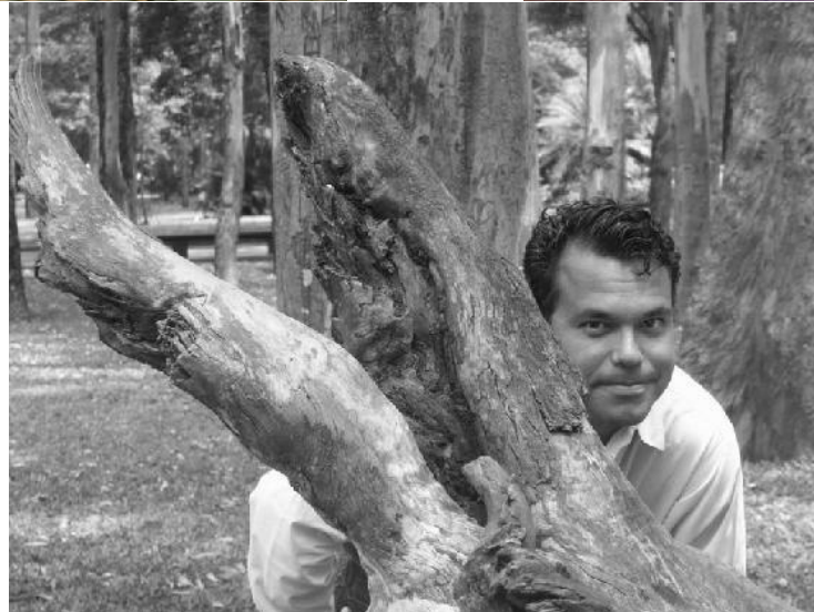
The Elusive Rafael The Second