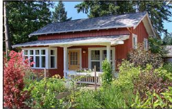
10512 128th Ave. NE, Kirkland, WA

Welcome home! Award-winning community built by nationally-recognized the Cottage Company & designed by Ross Chapin Architects. Old-fashioned neighborhood charm with today's sustainable amenities. Stroll along the flower-filled common area or sit on your porch and chat with your neighbors. This is the lifestyle you've been searching for.