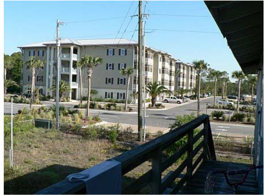
Condo on site of former cottages