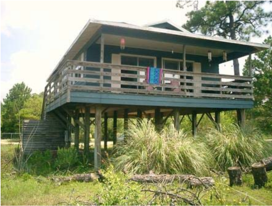
Surviving beach cottage