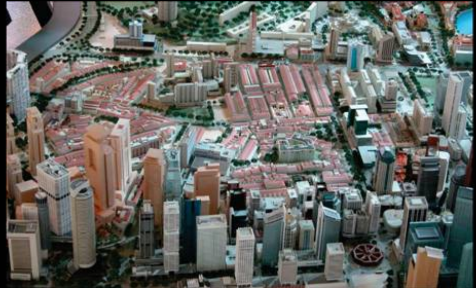
Chinatown in 2004