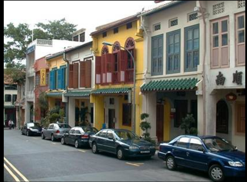
Cleaned, restored shop-houses post-redevelopment