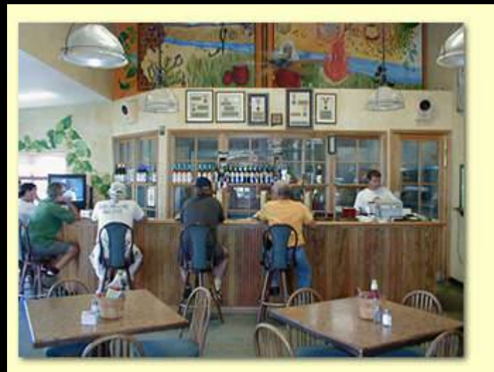
Second Street Brewery