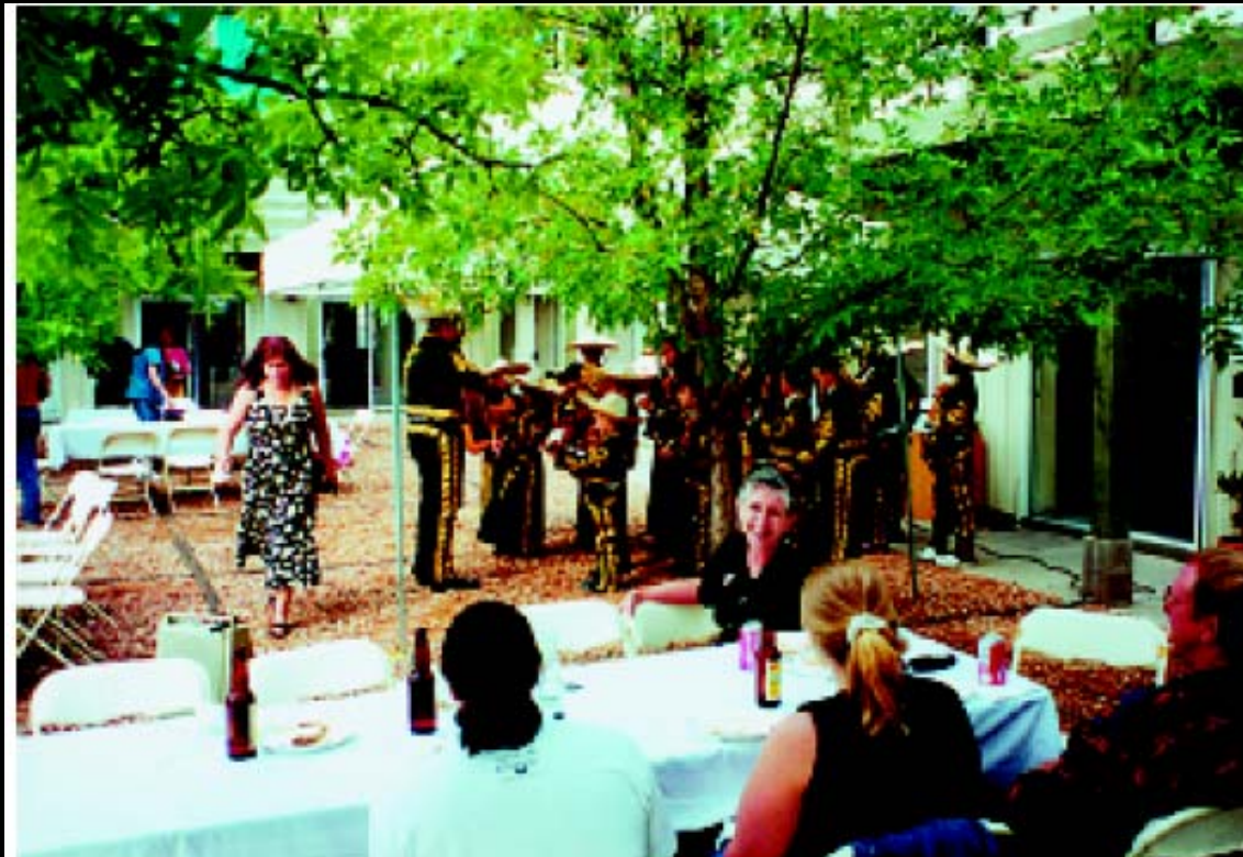
Second Street community picnic