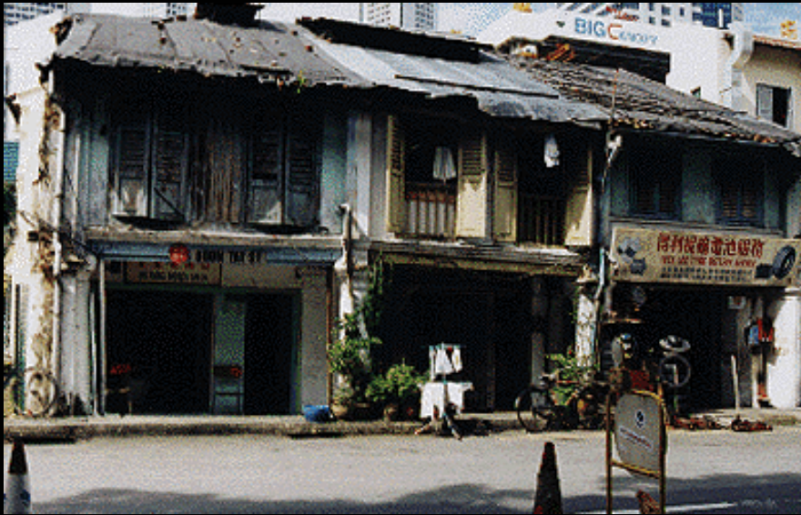
Dilapidated, crumbling shop-houses in Chinatown