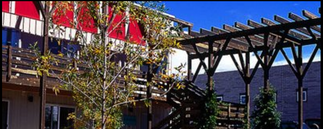
Newly developed Second Street Studios