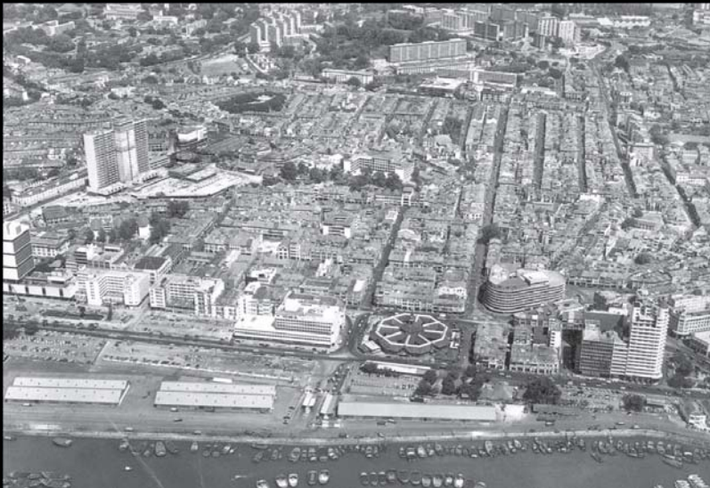
Chinatown in 1960s