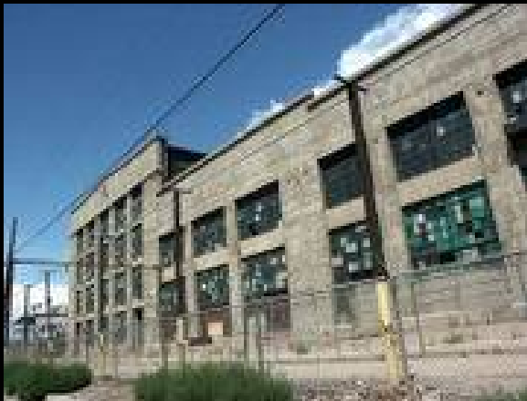
Second Street façade of machine shops