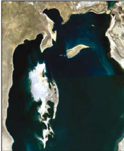
Aral Sea (12 August 2003)