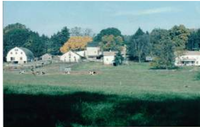
Fox Chase Farm