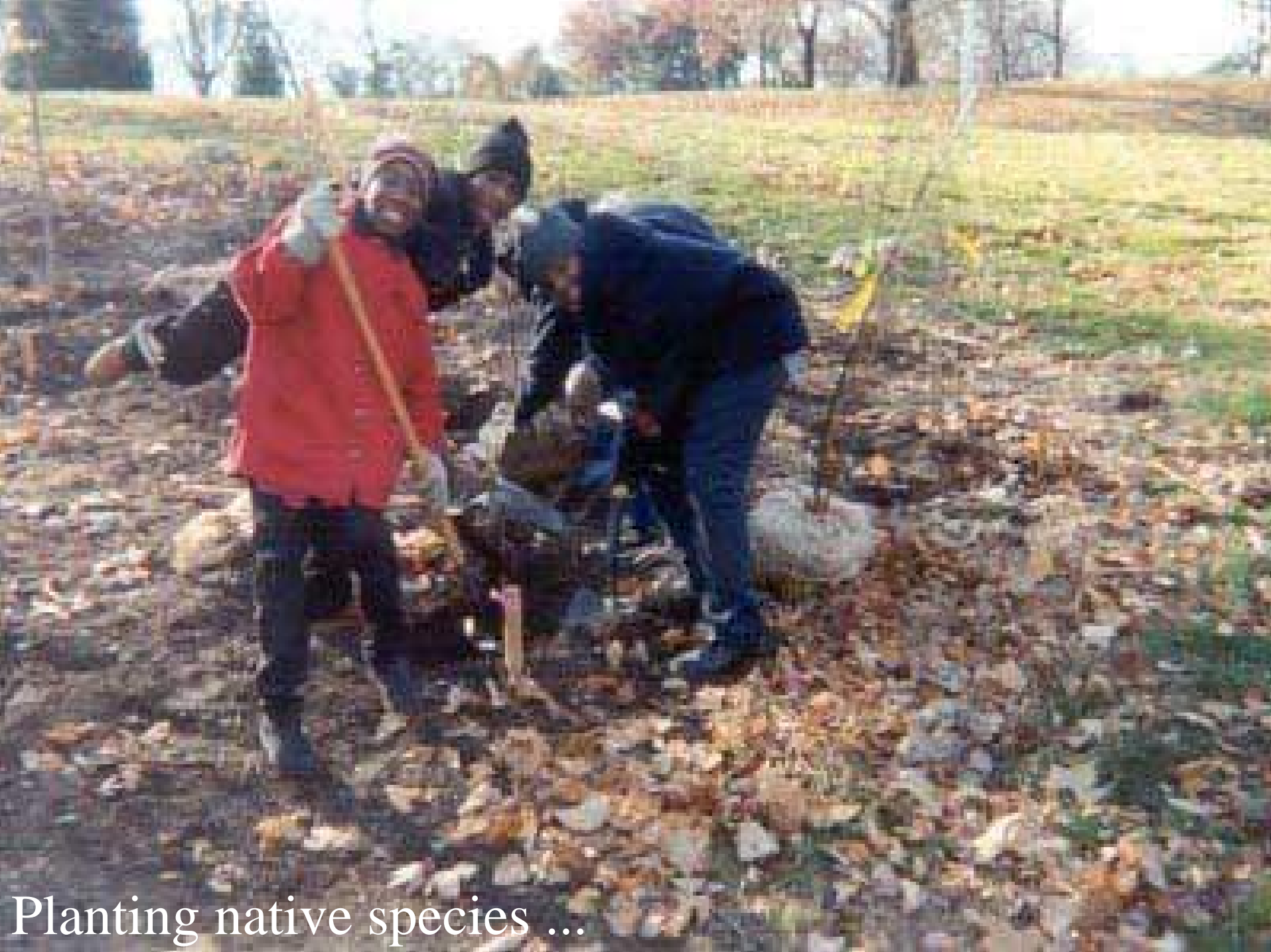
Planting native species ...