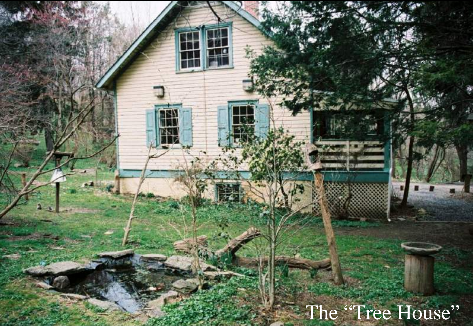
The “Tree House”