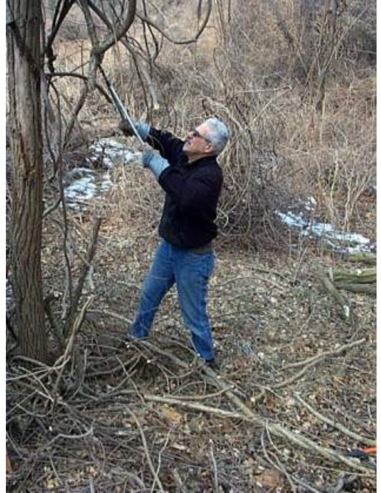
February's “Volunteer of the Month”