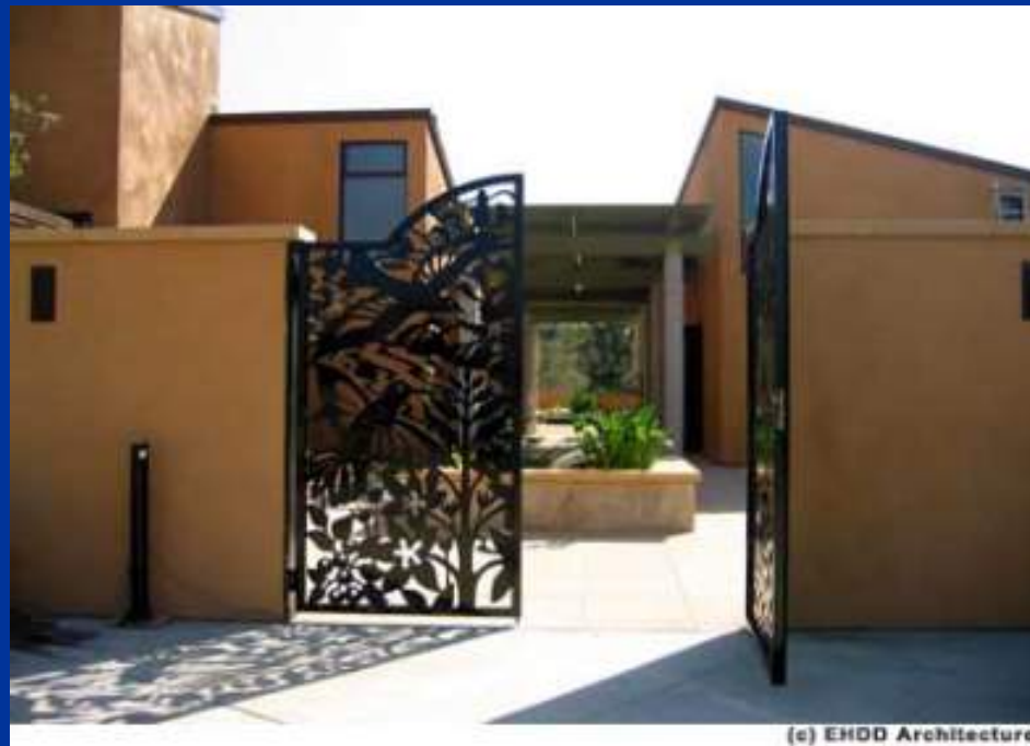
Audubon Center at Debs Park

“The building should not just be one you learn in , but learn from” – Elsa Lopez