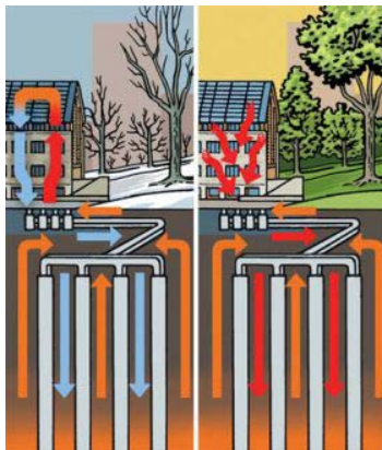
Illustration by Gregory Nemece of geothermal pump system.

The building is equipped with operable windows to the help reduce heating and cooling during spring and fall. The buildings occupants are alerted by indicator lights when outside conditions are suitable for opening and closing. In the winter months, the climate control is aided by the use of "super efficient air-handling units that recover heat from exhaust air (Gonshar). Central floor openings induce warm air to rise naturally for better ventilation with less energy (Centerbrook) and low-velocity fans in the basement keep the air circulating (Conniff). In the summer, water is sprayed into the exhaust air stream in the air handling units and this removes heat from incoming fresh air. They mechanism can reduce the supply air temperature up to 18° F without mechanical