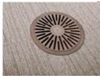
Individual Thermal Control