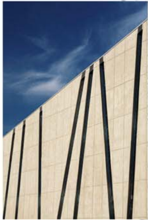
West Heat Load reducing wall