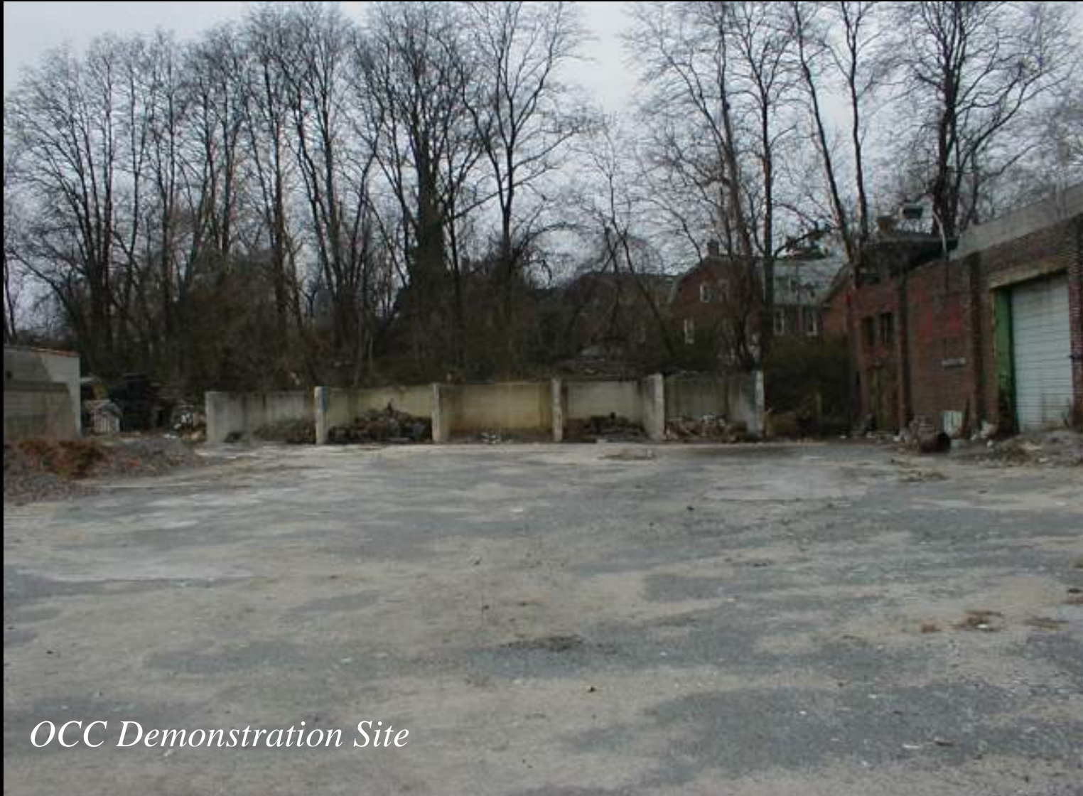
OCC Demonstration Site