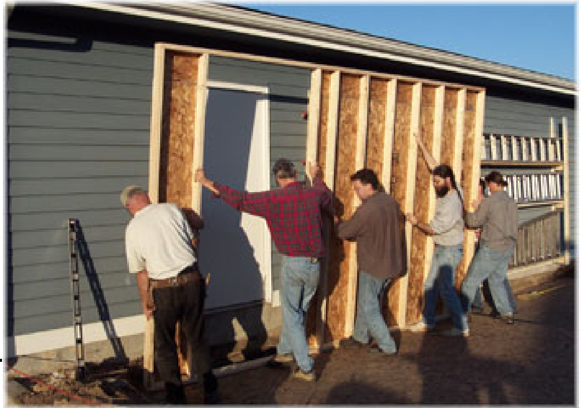
Sunward Cohousing, Ann Arbor